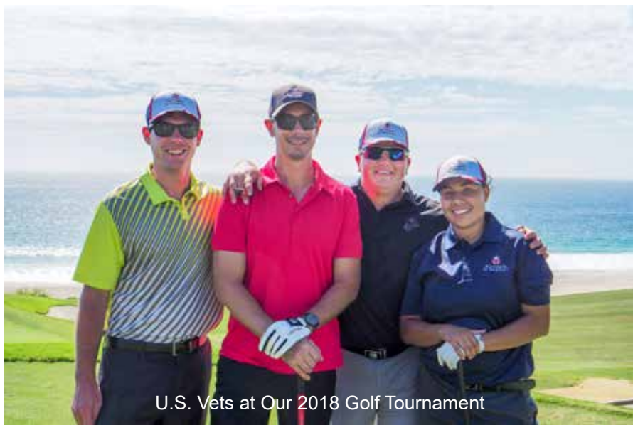
U.S. Vets at Our 2018 Golf Tournament

Strength in Support was created to battle the veteran suicide epidemic by providing holistic behavioral health services to military personnel, veterans AND their families through individual and family therapy, mentorship and workshops.