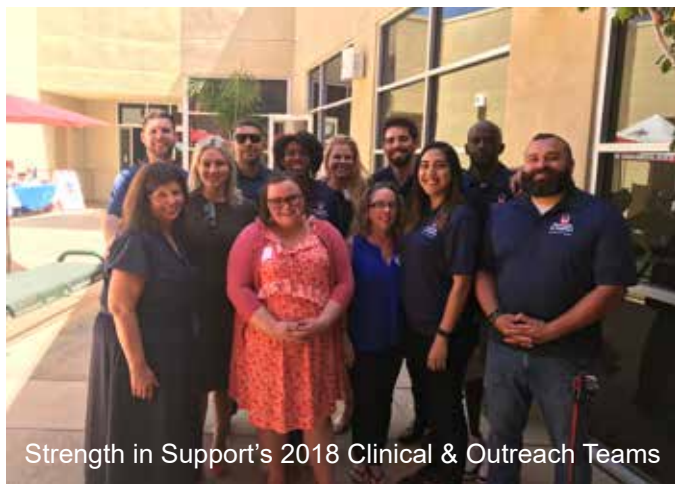
Strength in Support's 2018 Clinical & Outreach Teams

Strength in Support's founding board members have served veterans and their families in Southern California for decades through their private clinical practices and informal mentoring. They have observed how military funding has failed to meet the needs of simultaneous wars and how this has impacted veterans services, increased wait times and reduced advocacy for military families. It became clear something needed to change. Thus, a small group of passionate individuals — including veterans, military family members, therapists and businesspeople — formed SIS.